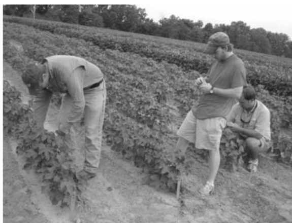
Figure 1. Harvesting leaf samples for use in marker assisted selection (MAS) of nematode resistant plants.

ance. Plants possessing the marker have a high probability of being resistant. Presence of the marker (resistant plant), or absence of the marker (susceptible plant), can be determined from the DNA of a small leaf sample. The advantages to MAS are numerous. Since MAS relies upon identification of plants with gene(s) for resistance, resistant plants can be selected regardless of the presence or absence of