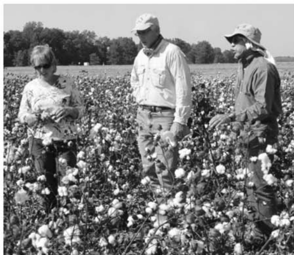
Figure 3. Marker assisted plant selection. Armed with marker information, breeders can concentrate on selecting the best looking nematode resistant plants.